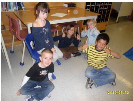
Thumbs up for Science East. They are awesome!